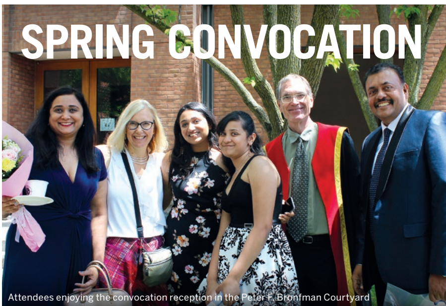
Attendees enjoying the convocation reception in the Peter F. Bronfman Courtyard