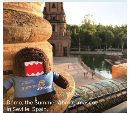
Domo, the Summer Abroad mascot in Seville, Spain.

This year more than 100 students received bursary funding that enabled them to participate in Summer Abroad.