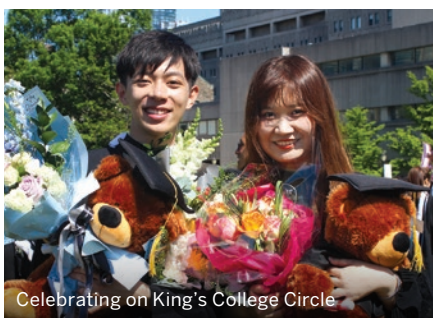
Celebrating on King's College Circle