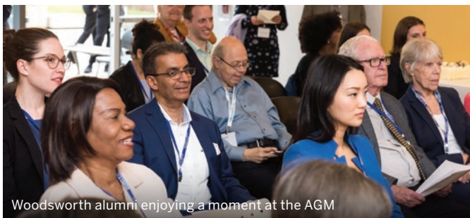
Woodsworth alumni enjoying a moment at the AGM