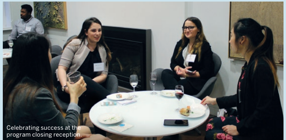
Celebrating success at the program closing reception.