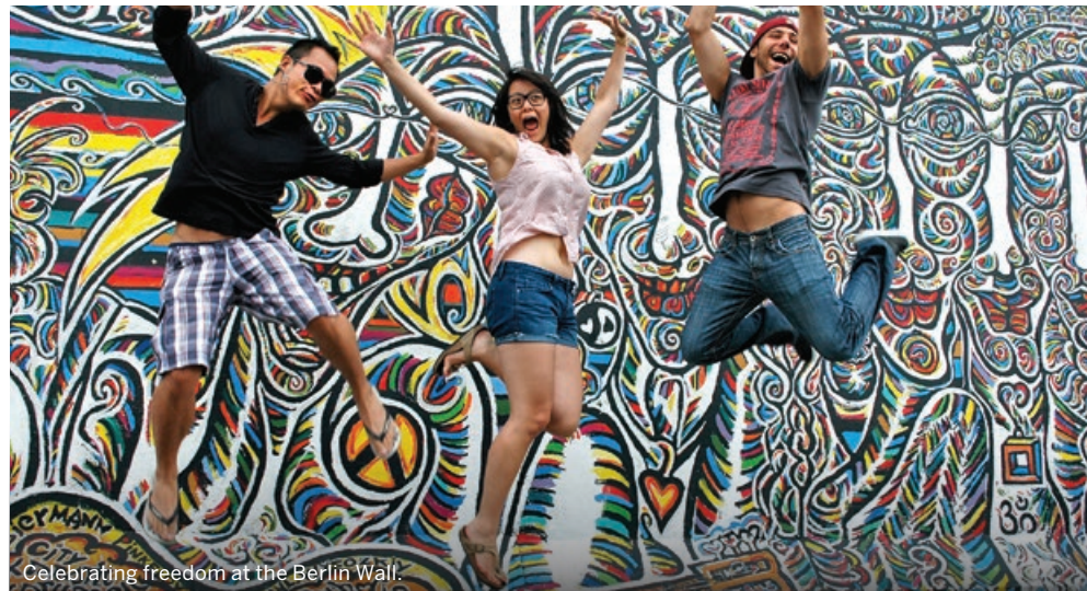
Celebrating freedom at the Berlin Wall.