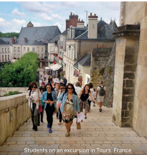
Students on an excursion in Tours, France.