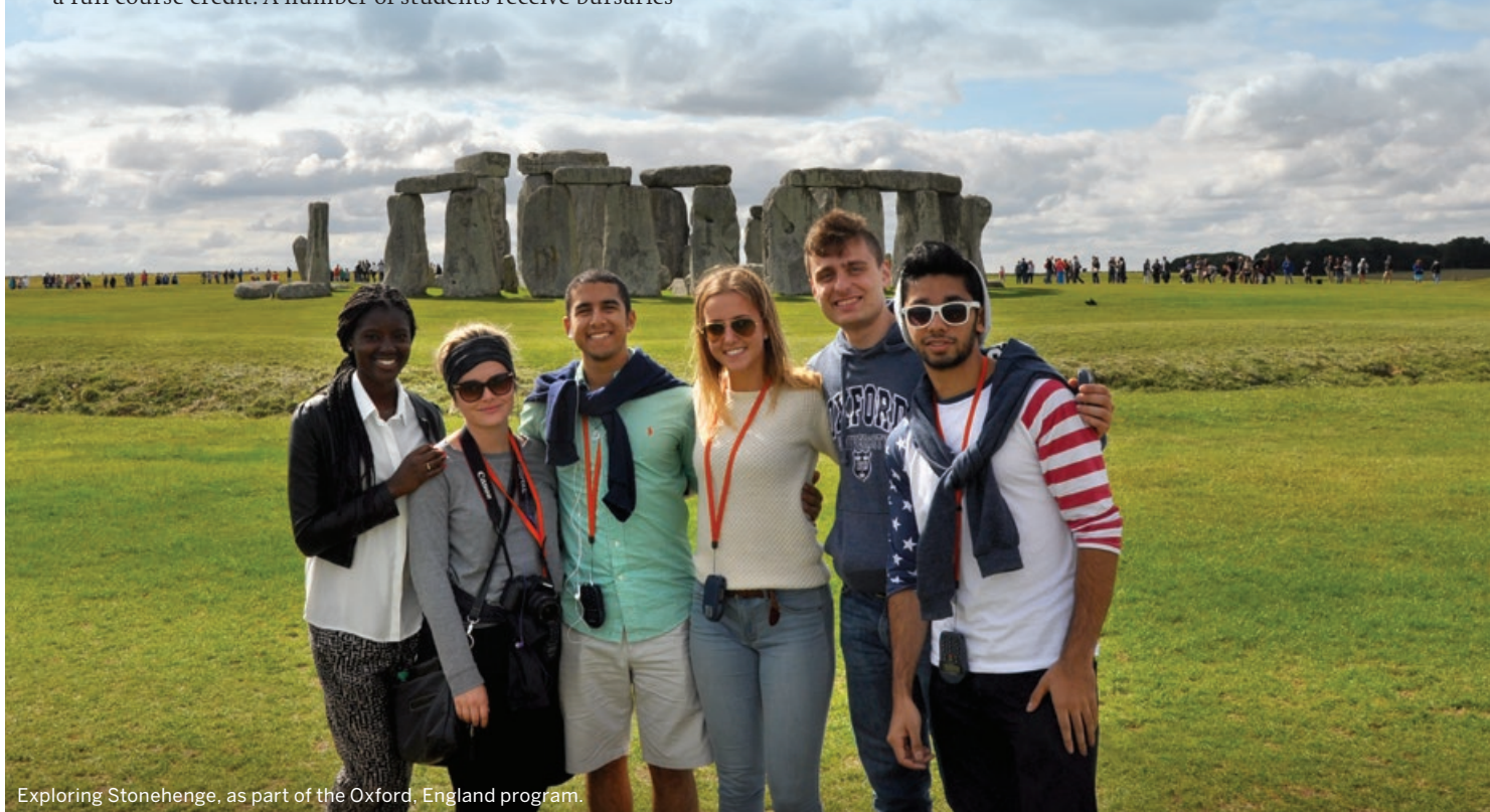
Exploring Stonehenge, as part of the Oxford, England program.

"They also become more independent, especially those who haven't lived away from home before. They learn to solve problems and deal with uncertainty." ■